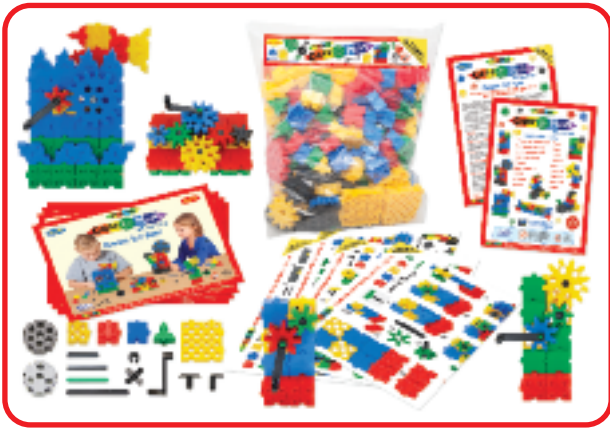
11020 B Gearphun Starter 200 Set. Set of 4 Instruction Sheets and a set of 16 Work Cards.

11020 B set is for 5 children to work with, making any 1 model from the instruction sheets.