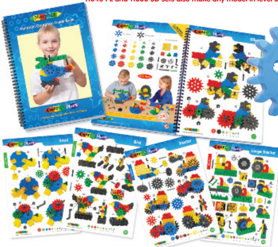
LT289 48 Page Gearphun Guide Book.

11040 PL and 11060 SD sets also make any model in level 5 instructions.