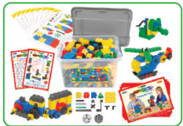
11060 SD Gearphun Starter 600 Set. Set of 10 Instruction Sheets and 3 sets of 16 Work Cards.

11040 PL and 11060 SD sets also make any model in level 5 instructions.