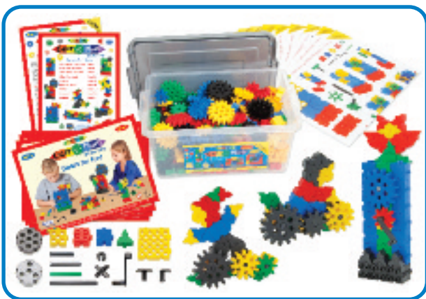
11040 PL Gearphun Starter 400 Set. Set of 10 Instruction Sheets and 2 sets of 16 Work Cards.